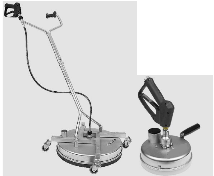
Mosmatic Vacuum Surface Cleaners

Hydromat Pump Out vacuum cleaners are particularly effective in Water recycling of Outdoor and indoor surface cleaning, for the suction of Water from Construction Sites and Applications where no indoor Drain is available. Sensibly priced to suit the tightest budget, Hydromat vacuum cleaners are built tough to last, and feature full service, 2 year warranty and Australia-wide spare parts back-up.